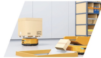
AMR Autonomous Mobile Robot