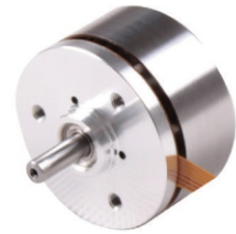
Outer Rotor Motor